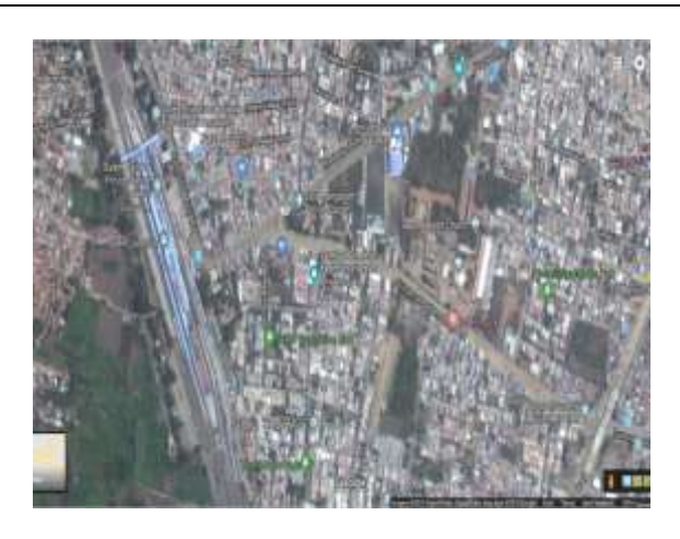
Google Image of the Study Area